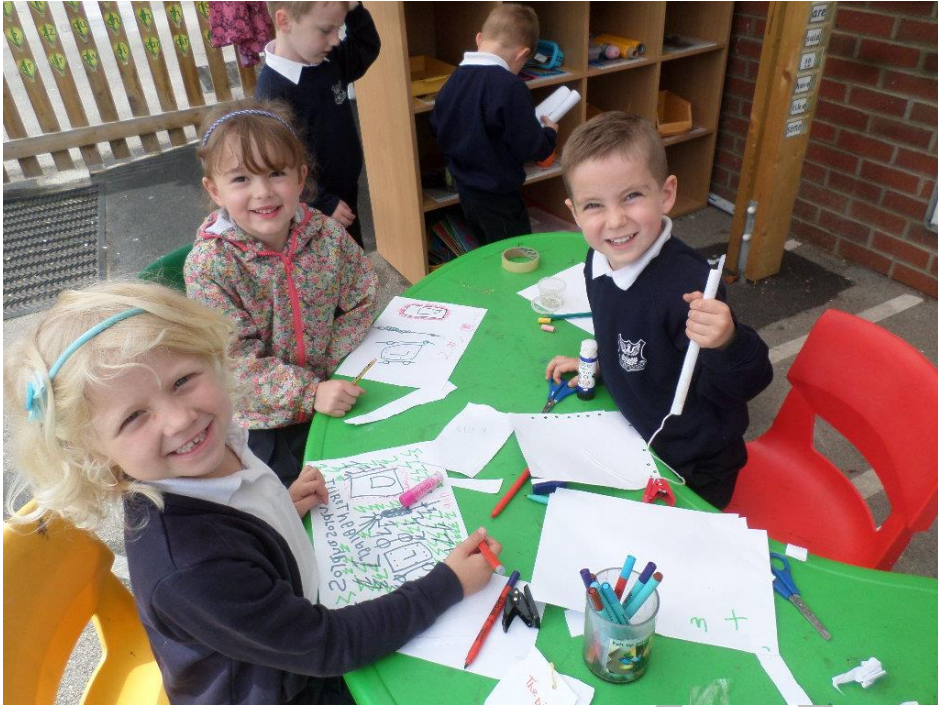
Our Books are Special: Introducing the Bible and Torah