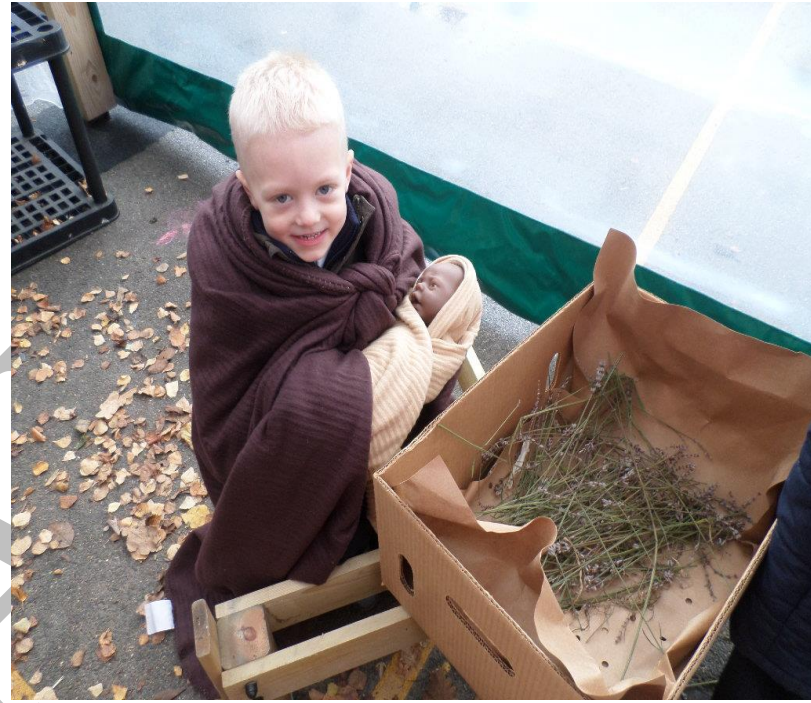
Special Times in my Life: Christmas role play